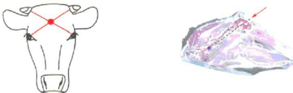
Figure source: Humane Slaughter Association (2005) Guidance Notes No. 3: Humane Killing of Livestock Using Firearms. Published by the Humane Slaughter Association, The Old School, Brewhouse Hill, Wheathampstead, Hertfordshire AL4 8AN, United Kingdom ( www.hsa.org.uk ).

Figure 1. The optimum shooting position for cattle is at the intersection of two imaginary lines drawn from the rear of the eyes to the opposite horn buds.