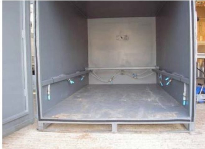
Figure 5. Examples of crates or modules being loaded into a container (containerised gassing unit) where gas is introduced.

This method is suitable for use in poultry and in neonatal sheep, goats and pigs.