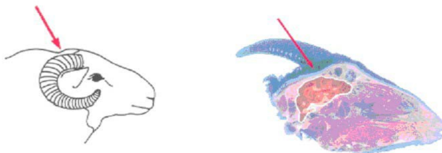
Figure Source: Humane Slaughter Association (2005) Guidance Notes No. 3: Humane Killing of Livestock Using Firearms. Published by the Humane Slaughter Association, The Old School, Brewhouse Hill, Wheathampstead, Hertfordshire AL4 8AN, United Kingdom ( www.hsa.org.uk ).

Figure 3. The optimum shooting position for heavily horned sheep and horned goats is behind the poll aiming towards the angle of the jaw.